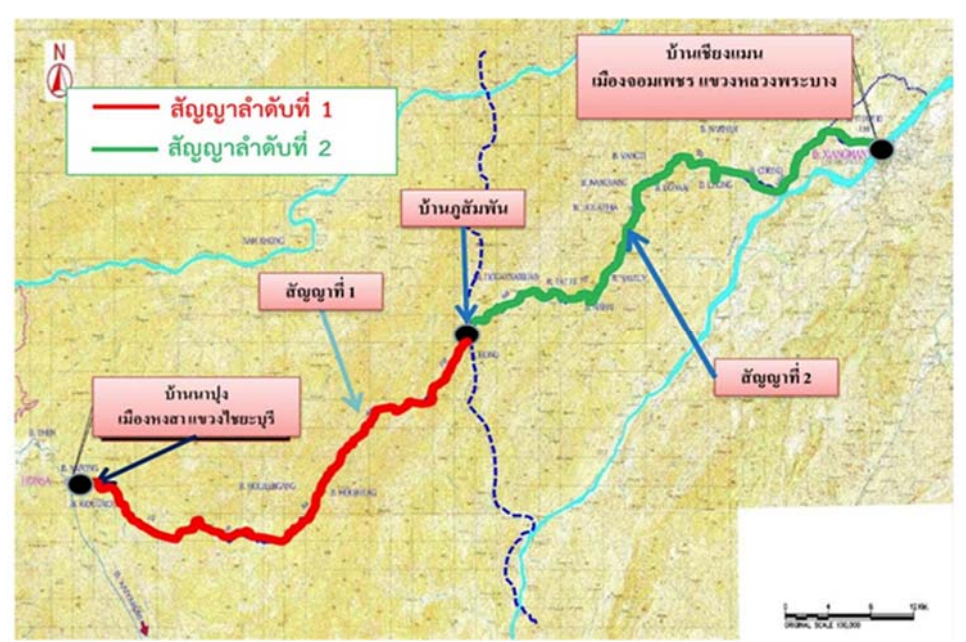
Contract 1: Sta. 0+000 - Sta. 42+300